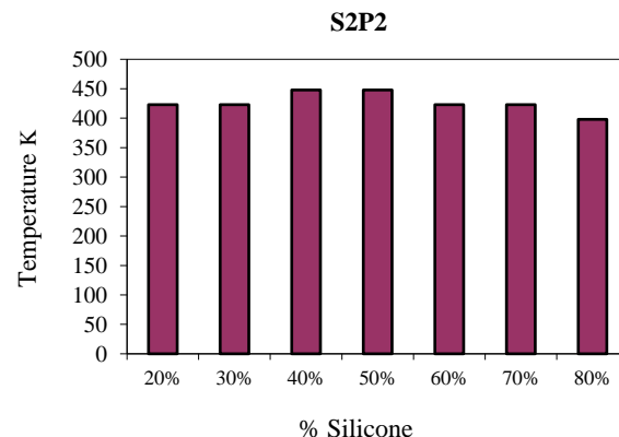
Fig.2. Thermal Stability of the Coating

In the heat resistance test, the samples were heated in a furnace at different temperatures. The maximum temperature that the coating could withstand was found by identifying cracks, chalking and colour changes. 40% P2 resin with S2 resins withstood temperatures up to 448 K for 24 hours. The other compositions had showed lower thermal stability. The effect of silicone composition on the ability to withstand for higher temperature is shown in Fig. 2.